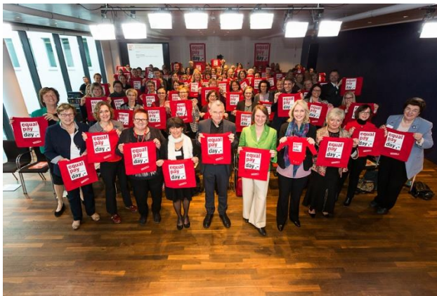
Photo 3: Equal Pay Day Forum with Manuela Schwesig, Minister for Family Affairs, and Henrike von Platen, President BPW Germany

The Equal Pay Day in Germany was held on March 19, 2016. Under the theme JOBS WITH A FUTURE. WHAT IS THE VALUE OF MY WORK?, the value and remuneration of female-dominate care work and the effects of career choices in the life course have been debated. The red EPD flags could be found across Germany and around the Victory Column in Berlin. From there, BPW Germany has started the 'triumphal march of equal pay'. The Equal Pay Day has been celebrated across Germany with more than 1,000 events and steadily expanding media coverage. In Germany, the gender pay gap stays at a rather high level of 21 per cent (2015) – Germany ranking among the poorest performers in the EU.